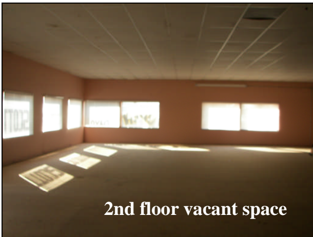
2nd floor vacant space