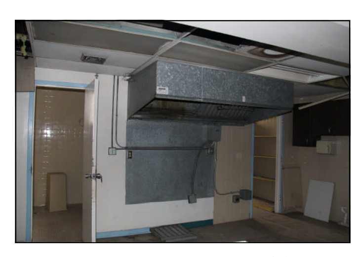
Former Kitchen Area