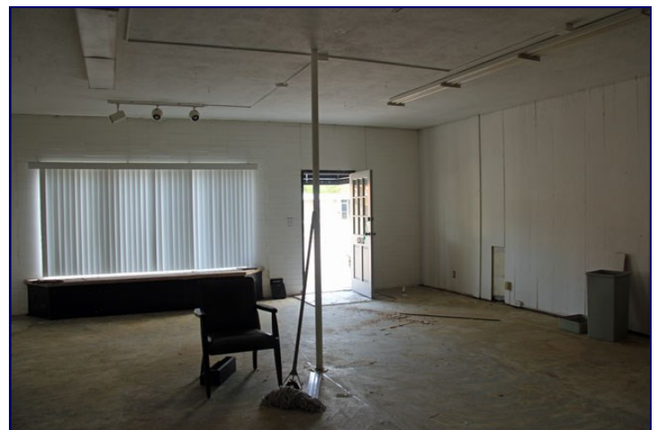
Vacant Office Adjacent

Steven@TampaCommercialRealEstate.com (813) 785-3665