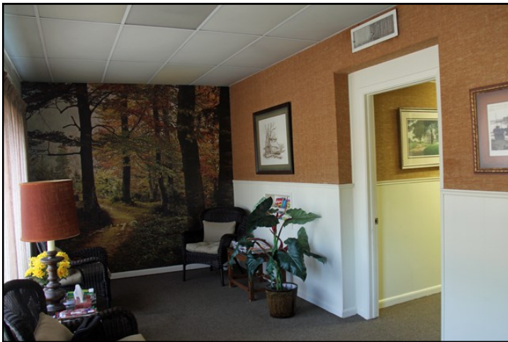
Patient Waiting Room