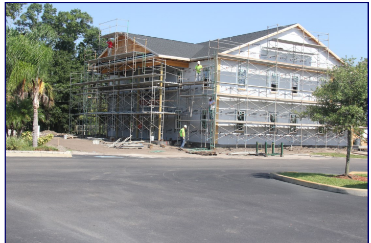
B—Retail and Office

United Business Park is a new development on 24 acres comprising of (A) Retail Space fronting on Hillsborough Ave, (B) Retail Plus Office/Medical Space and (C) Flex space at the rear of the property