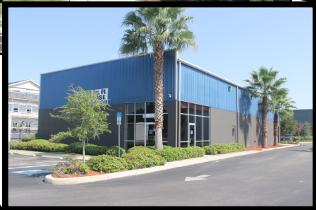
A— Retail Space