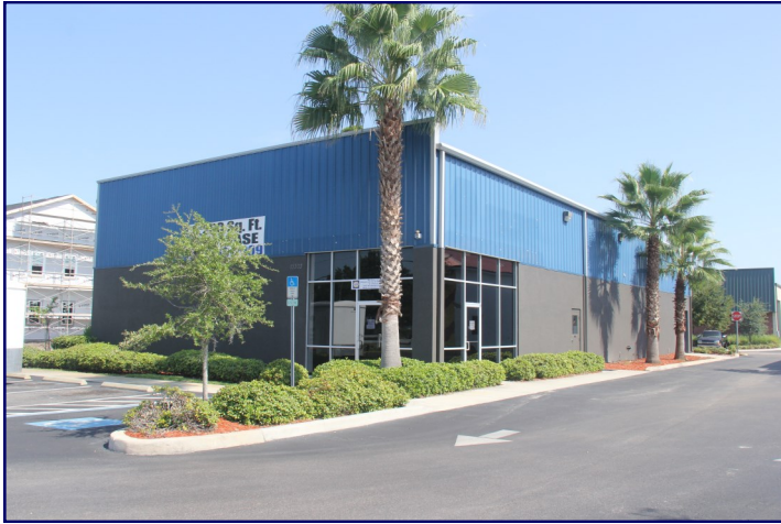
A— Retail Space Former NAPA space