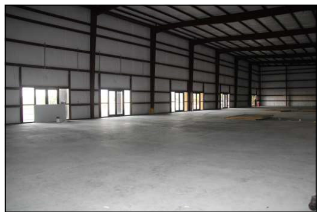
Rear Building—30 ft ceilings. 5,000 sf available. Visibility from US 19. Adjacent Children's Activity Space

Steven@TampaCommercialRealEstate.com (813) 785-3665