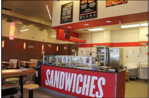
Jimmy Johns—new store open