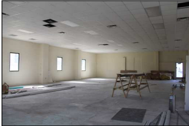
Proposed Restaurant Space