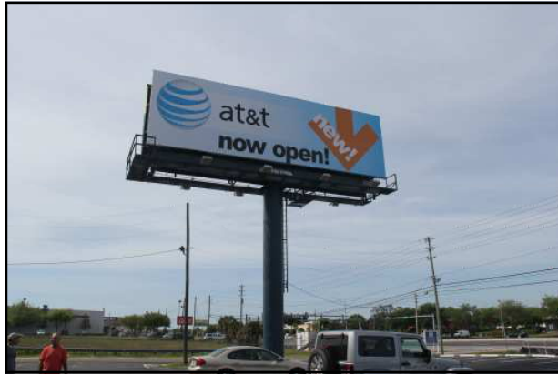
AT&T—new store open