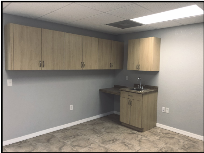
Medical Exam Room